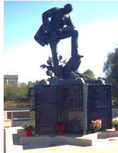
Peace Officers Memorial, State Capitol

A report on law enforcement activities funded by the Drug and Gang Enforcement Account or the Criminal Justice Enhancement Fund and relating to illicit drugs and drug related gang activity.